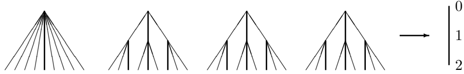
FIGURE 2. \text{DL}_4^2(3) is a subset of the product of these trees.

The graph \text{DL}_d^k(q) is the Cayley graph of the index k subgroup \Gamma_d^k(q) of \Gamma_d(q) .