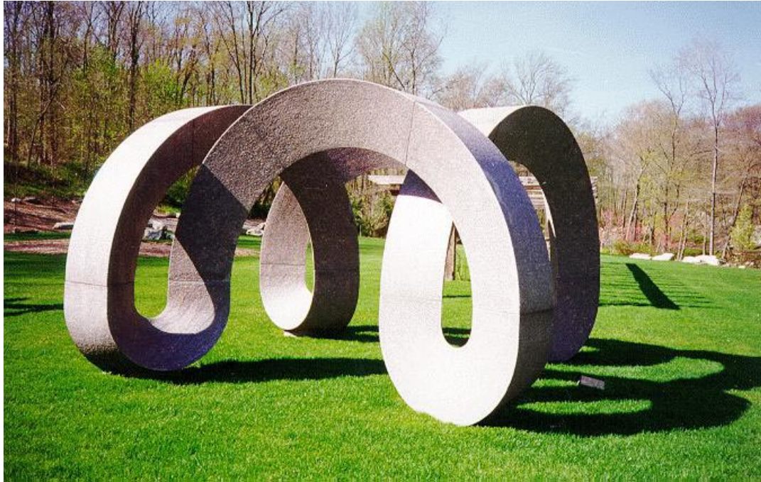
The Arch of Janus , Charles Perry, Granite, 14' \times 14' \times 10' , private collection.